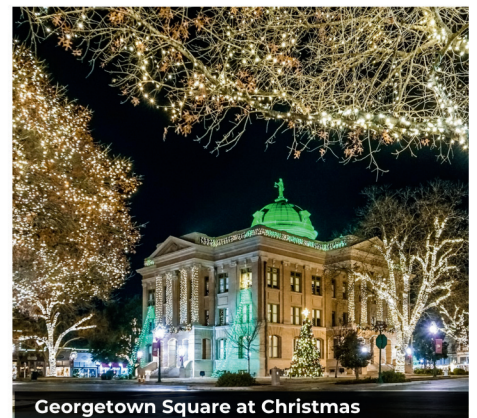
Georgetown Square at Christmas