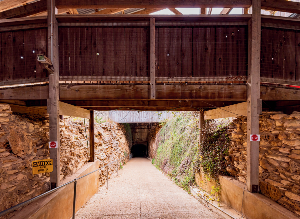
Inner Space Cavern