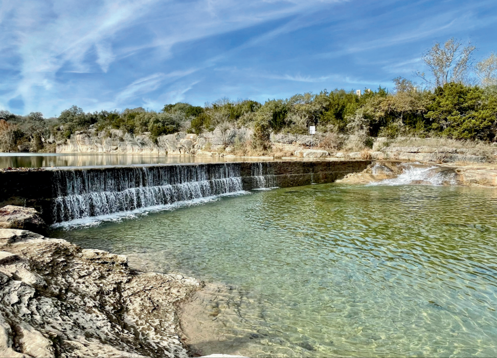
Blue Hole Park and Pool