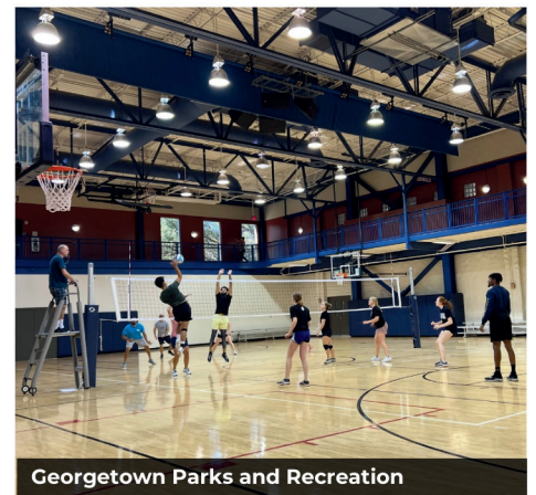
Georgetown Parks and Recreation