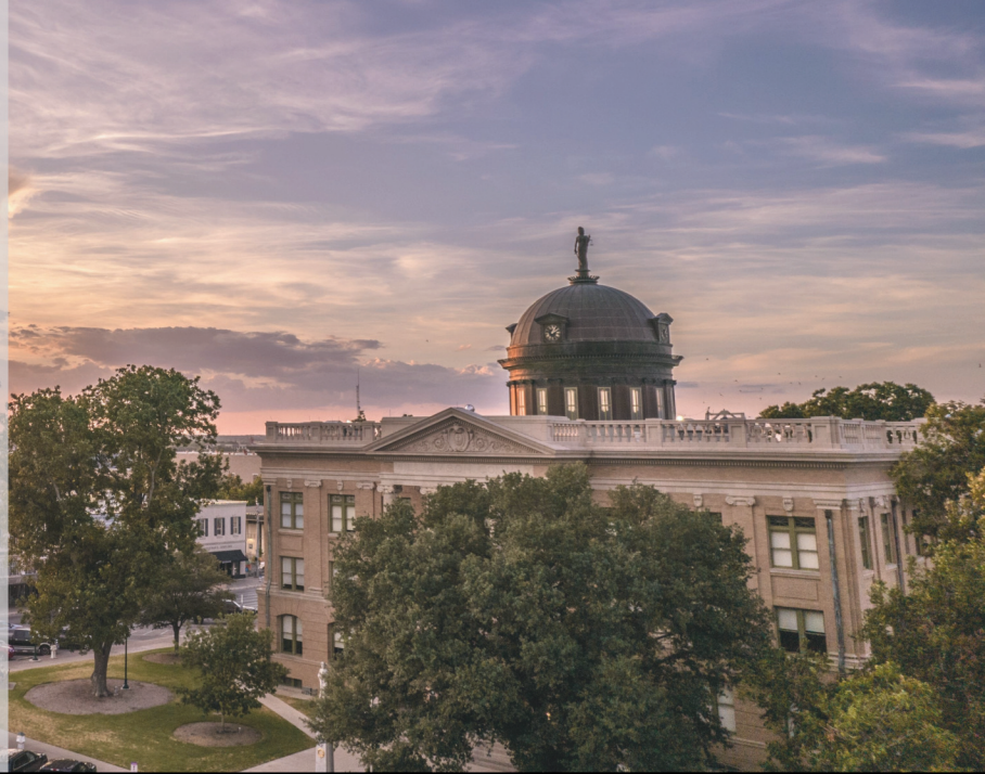
Georgetown City Hall

Georgetown offers a fantastic opportunity for residents to savor a leisurely stroll along the picturesque San Gabriel River or indulge in a game of golf at one of its five local courses. For avid mountain bikers, the trails around Lake Georgetown beckon, guiding riders to the scenic fringes of the renowned Texas Hill Country. Additionally, the city's annual food and arts festivals, a plethora of independently owned restaurants, thrilling rodeo events, nearby wineries, and charming Victorian commercial architecture ensure that residents have a wealth of enticing attractions to explore right in their own backyard.