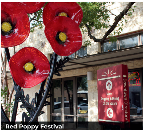
Red Poppy Festival

For more events information please visit visit.georgetown.org