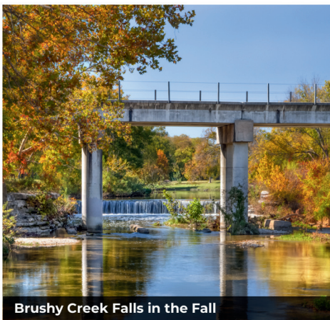
Brushy Creek Falls in the Fall

**Always check websites for park information, hours, and if reservations are needed.