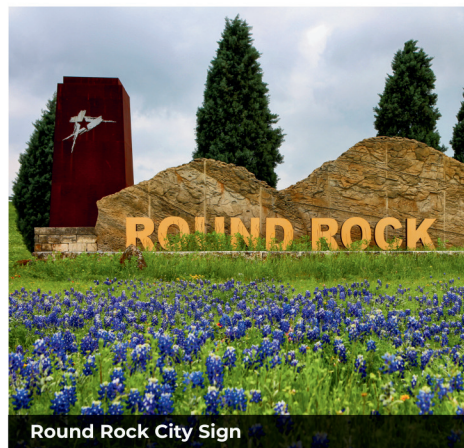
Round Rock City Sign