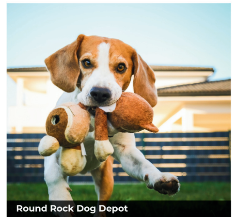
Round Rock Dog Depot