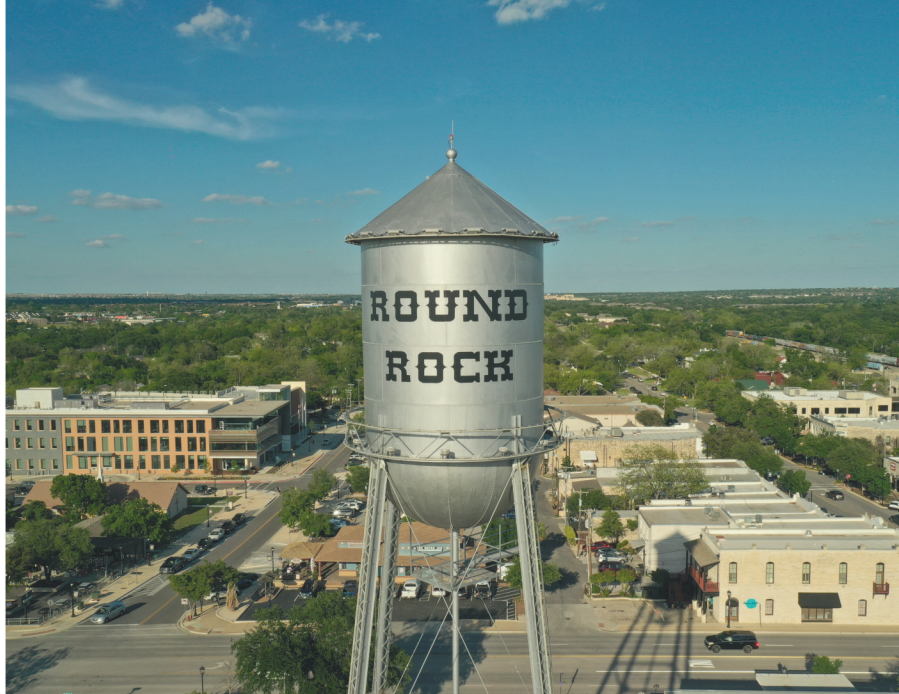
Round Rock Water Tower

Discover Round Rock, Texas: A city that balances economic progress and quality of life! Round Rock, Texas is a city that is quickly growing and has become a hub for economic advancement. It has also maintained an exceptional quality of life. The city has an esteemed master plan, a top-notch school district, and a remarkable park system.