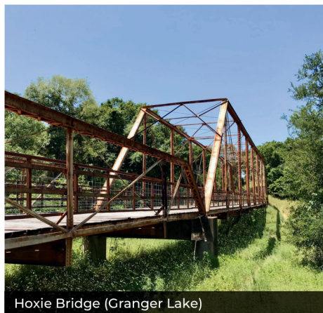
Hoxie Bridge (Granger Lake)