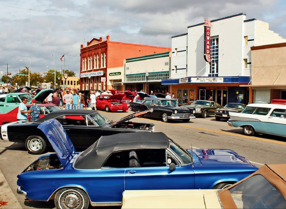
Main Street Car Show