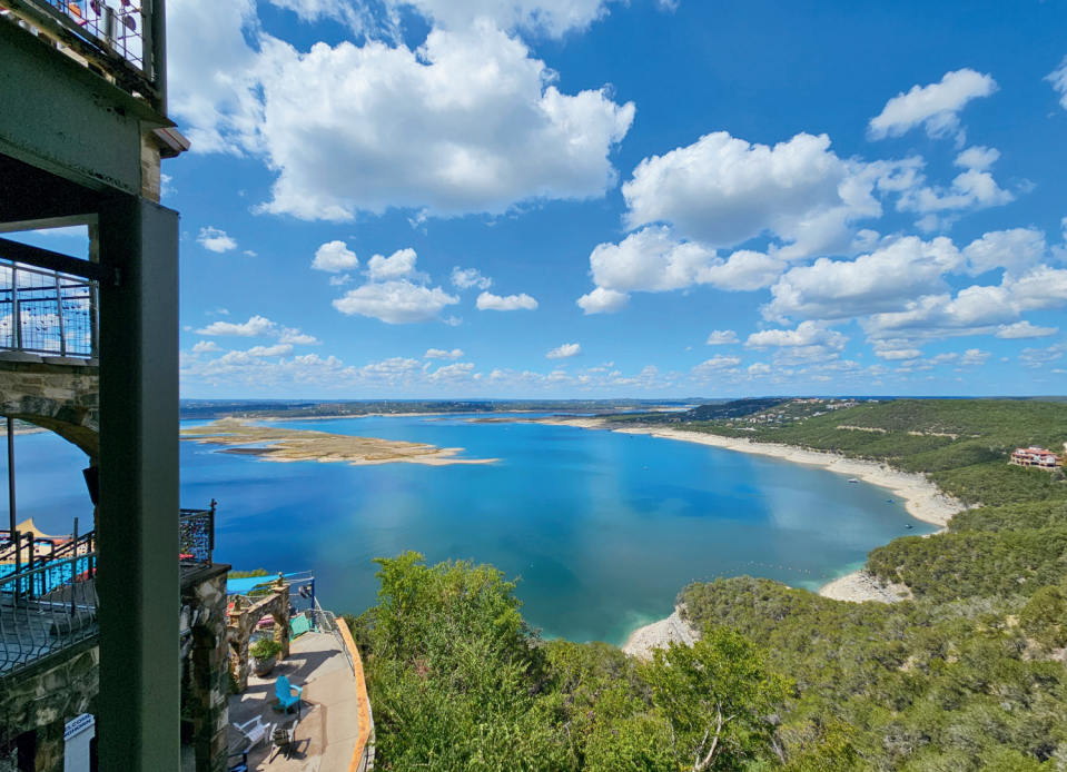
The Oasis - Lake Travis