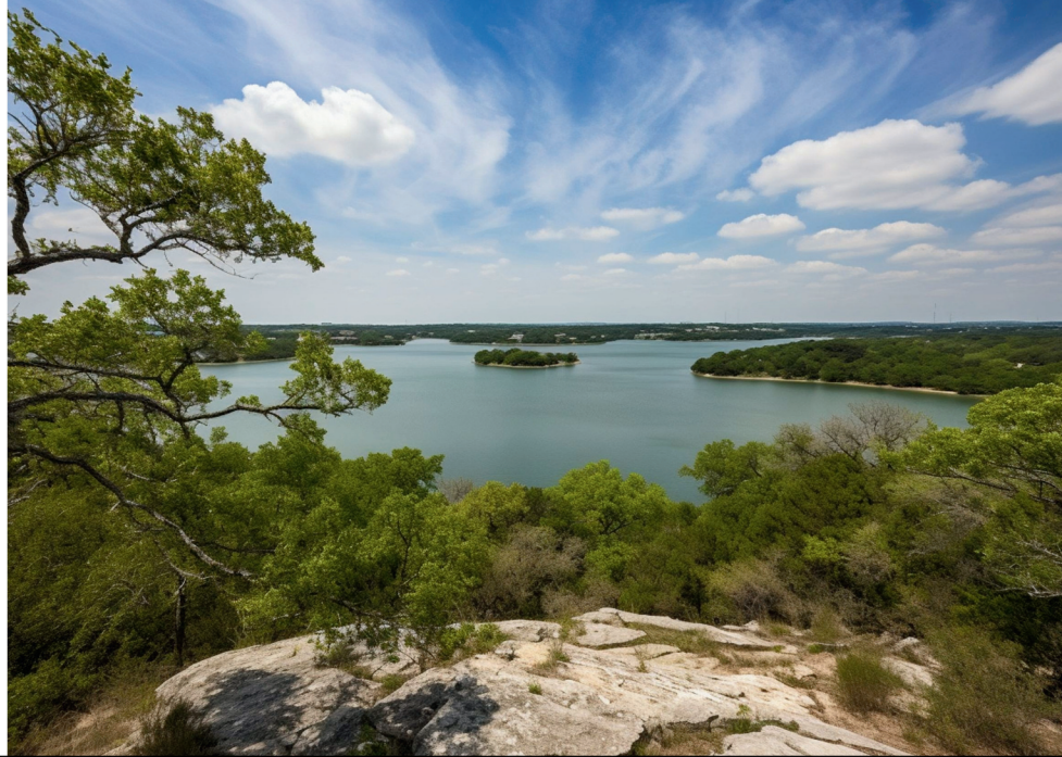
Hiking near Lake Travis