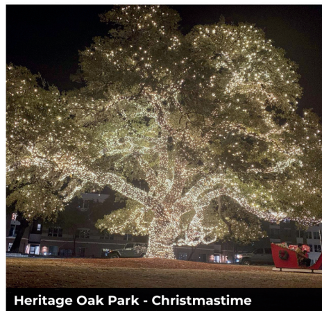
Heritage Oak Park - Christmastime