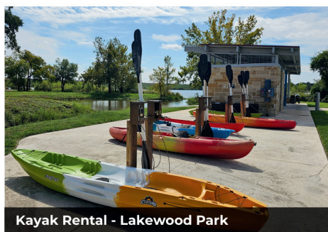
Kayak Rental - Lakewood Park