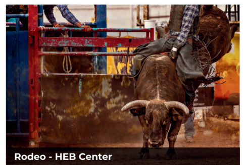
Rodeo - HEB Center