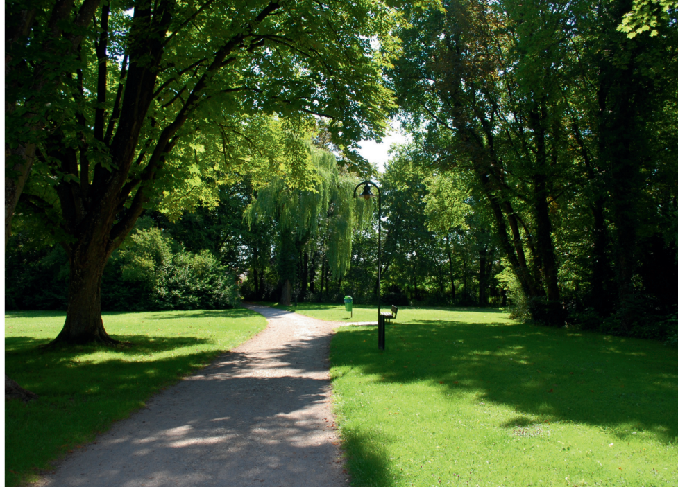
Trails in Cedar Park