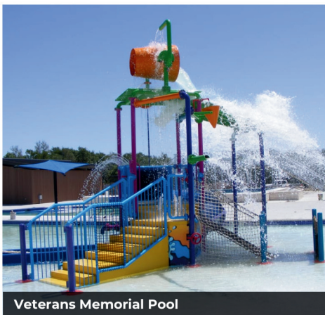
Veterans Memorial Pool

**Always check websites for park information, hours, and if reservations are needed.